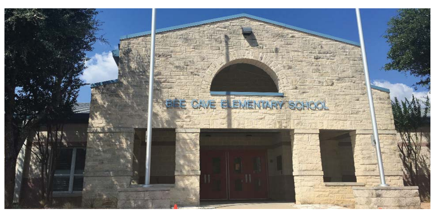
Bee Cave Elementary School

In terms of educational attainment, Bee Cave is a highly educated city. The majority of residents, 62% over the 25 years of age, have a bachelor's degree, 25% of the population has a graduate level degree, and 99% have a high school diploma. This is in contrast to the State of Texas where only 27% have completed a bachelor's degree or higher.